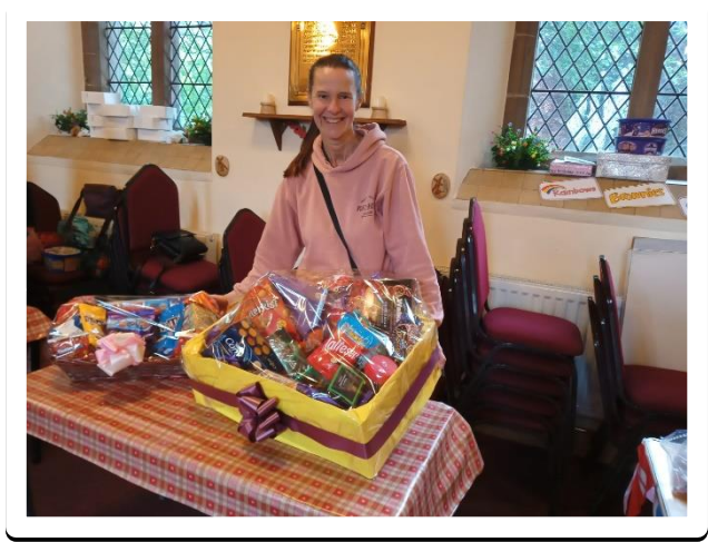
fundraising activities throughout the year providing relief and help to the Little Brothers of the Good Shepherd in Wolverhampton who seek to provide shelter and food to the homeless and to the Haven & GEMS Women's Refuge Centre and the maternity wards of Princess Royal, Telford, New Cross Hospital, Wolverhampton and Walsall Manor.

We also have several people who regularly make monetary donations. Throughout the year we raise money to support Christian Aid, Water Aid, Compton Hospice for the terminally ill and the Children's Society. Our highly successful branch of Mothers Union holds numerous