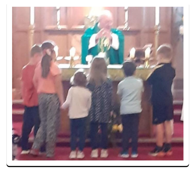
involved in church events. They started off 9 years ago using the church space but have now moved to the school as their numbers have grown. Church