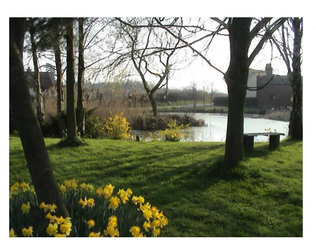
Colton in the Spring