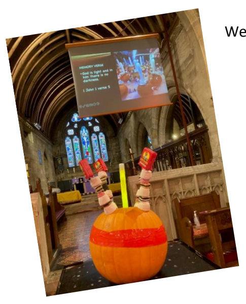
We love Christingle!