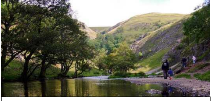
Dovedale (location of one of the Diocese's two residential retreat centres)

can provide it. And then there's many museums including Walsall's New Art Gallery and the RAF museum at Cosford; not to mention excellent sporting options for both watching and participating – from premiership football to the Tamworth Snowdome. Along with Wedgwood, theatres and cinemas,