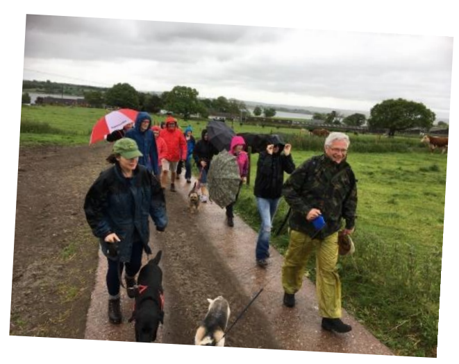
Rogation walk in Blithfield.