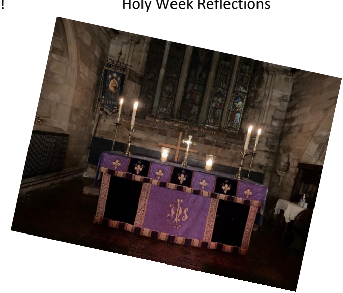
Holy Week Reflections