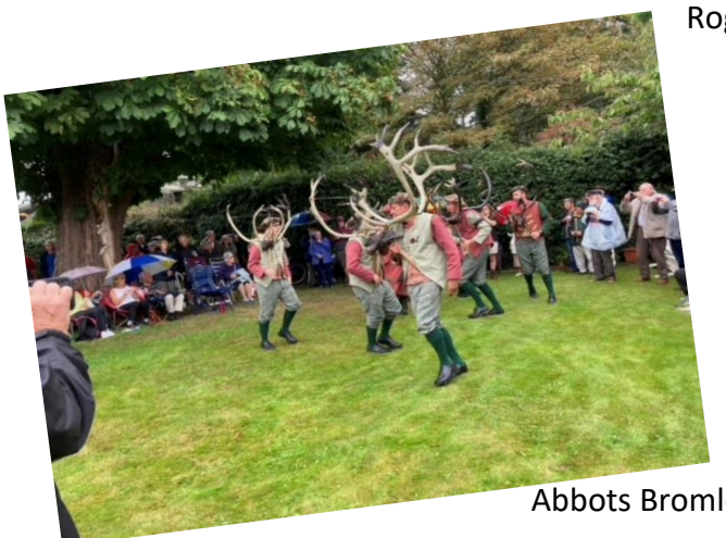
Abbots Bromley Horn Dance