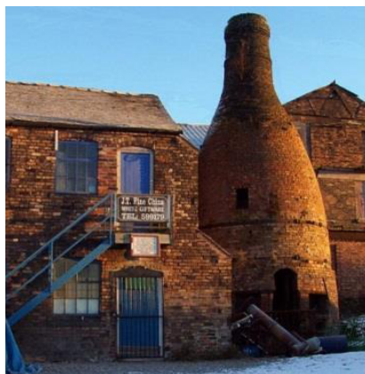
David Rayner (Wikipedia) / Stoke-on-Trent Bottle Kiln / CC BY-SA 2.0BY-SA 4.0

Staffordshire prides itself on being ‘the Creative County’: Shropshire is the birthplace of the Industrial Revolution and the Black Country is renowned for its industry and all have significant opportunities for spouses who wish to develop careers in any sphere.