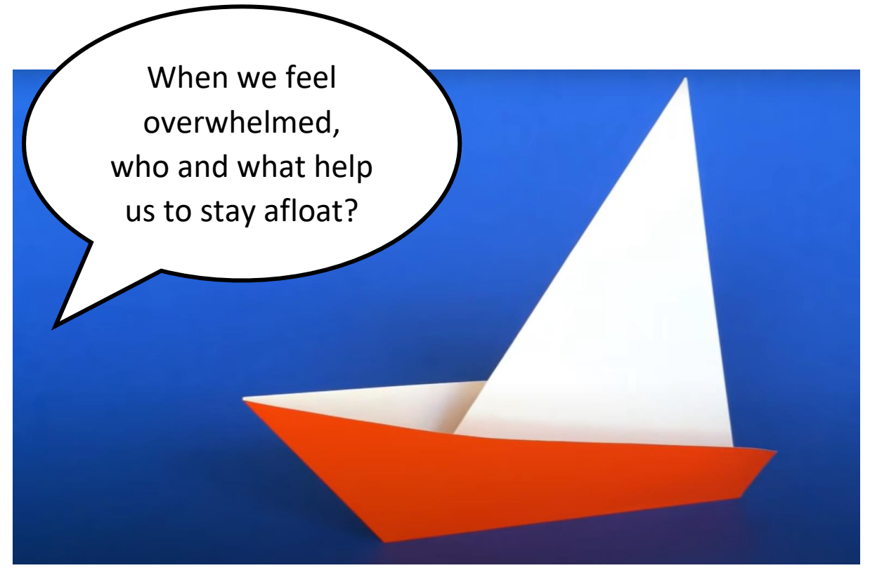
From "How to make a very easy origami sail boat": https://www.youtube.com/watch?v=NcieP3uy4Dc

Let's spend a few minutes naming the people and things that help us to stay afloat, writing them onto our paper boat.