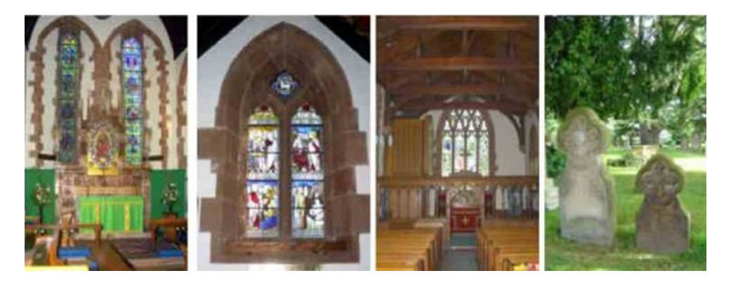
The Church offers facilities for the disabled including a loop system for the hard of hearing, large print service books, a wheelchair, a toilet for the disabled and chair lift access to the Loft.

The Church is surrounded by a well-kept churchyard, which is professionally maintained. Additional land was purchased to extend the churchyard in the 1990s and this is now in use.