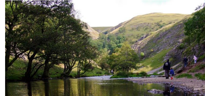
Dovedale (location of one of the Diocese’s two residential retreat centres)

Rail links are also good with all major towns having direct services to London and Birmingham and four major airports surround our borders – Birmingham, East Midlands, Manchester and Liverpool.