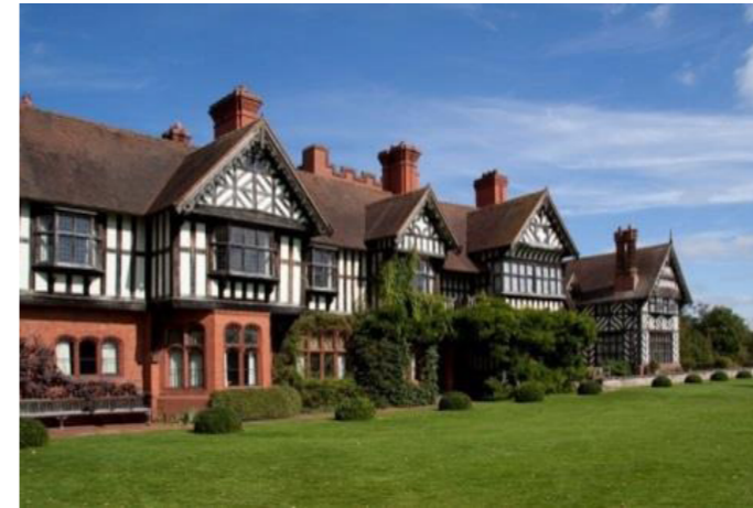
Wightwick Manor nr Wolverhampton