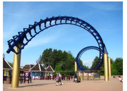
Alton Towers near Uttoxeter