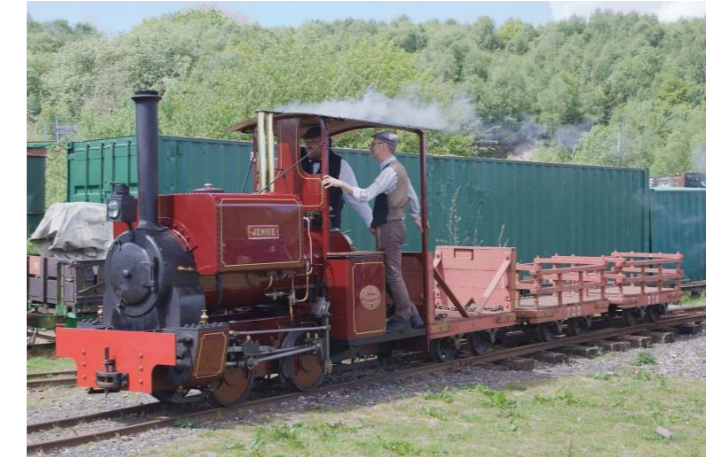
Apedale Valley Light Railway near Stoke with the adjacent country park and Heritage Centre is one of many transport and leisure museums in the Diocese