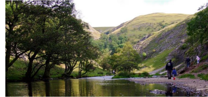
Dovedale (location of one of the Diocese’s two residential retreat centres)

Rail links are also good with all major towns having direct services to London and Birmingham and four major airports surround our borders – Birmingham, East Midlands, Manchester and Liverpool.