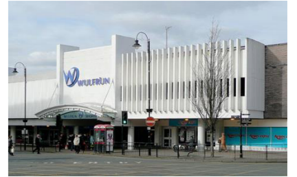
Wulfrun Centre in Wolverhampton is one of many shopping destinations in the region

If shopping is your thing, there is a range of options, from the chic boutiques at Barton Marina, and Shrewsbury to large malls in or near the urban centres. We’re fortunate in being the home of many fine ales and beers brewed in Burton on Trent (the museum is well worth a visit), and Staffordshire oatcakes are a unique local delicacy to be discovered.