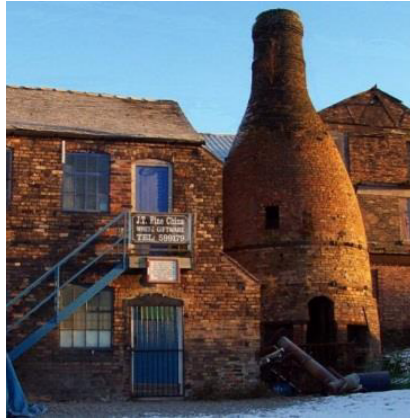
David Rayner (Wikipedia) / Stoke-on-Trent Bottle Kiln / CC BY-SA 2.0BY-SA 4.0

Staffordshire prides itself on being ‘the Creative County’: Shropshire is the birthplace of the Industrial Revolution and the Black Country is renowned for its industry and all have significant opportunities for spouses who wish to develop careers in any sphere.