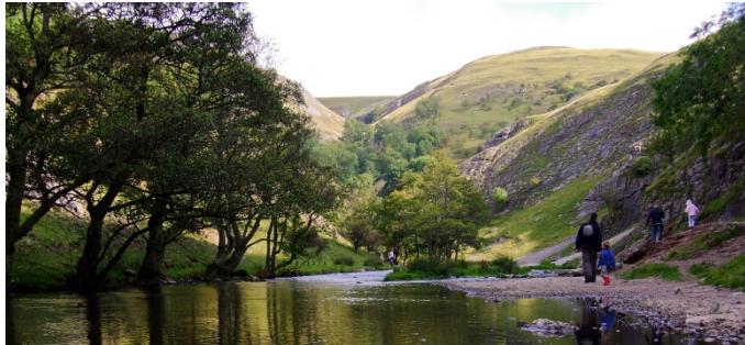
Dovedale (location of one of the Diocese's two residential retreat centres)