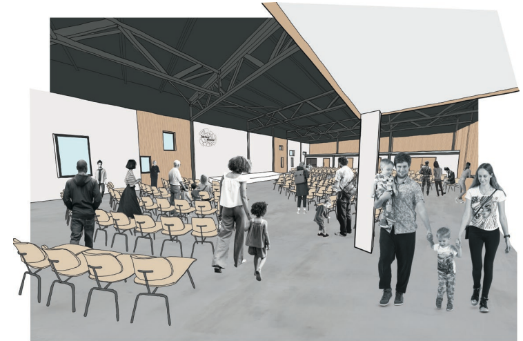
Worship area visual

The Diocese of Lichfield either has a curate's house in the benefice or a 'strategic' house for curates in close proximity of the benefice. These are good houses, mainly with four bedrooms. If there is no curate's house in the benefice and where such a strategic property exists within easy reach of the proposed training parish this will be the preferred curate's house. If there is no strategic housing available nearby the diocese is committed to providing appropriate accommodation for all those entering ministry. We generally do not offer rented accommodation except as an emergency short term measure. Our curates can be confident that their home will be of a consistently high standard. If you wish to know further details about the house, the DDO will be able to provide you with more information.