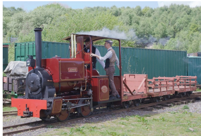
Apedale Valley Light Railway nr Stoke is one of many transport and leisure museums in the Diocese