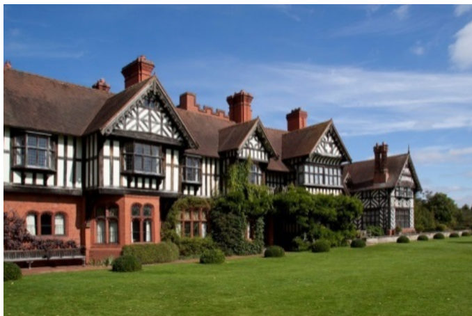
Wightwick Manor nr Wolverhampton