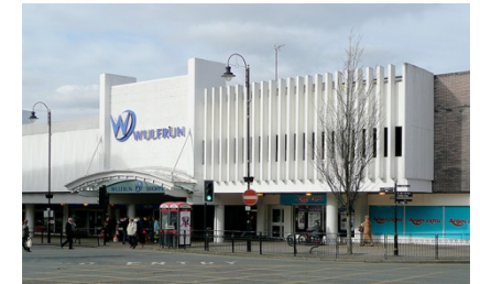
Wulfrun Centre in Wolverhampton is one of many shopping destinations in the region

If shopping is your thing, there is a range of options, from the chic boutiques at Barton Marina, and Shrewsbury to large malls in or near the urban centres. We're fortunate in being the home of many fine ales and beers brewed in Burton on Trent (the museum is well worth a visit), and Staffordshire oatcakes are a unique local delicacy to be discovered.