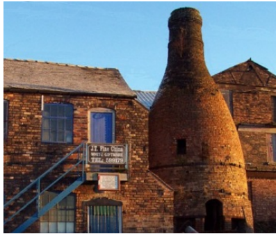
Stoke-on-Trent Bottle Kiln

Staffordshire prides itself on being 'the Creative County': Shropshire is the birthplace of the Industrial Revolution and the Black Country is renowned for its industry and all have significant opportunities for spouses who wish to develop careers in any sphere.