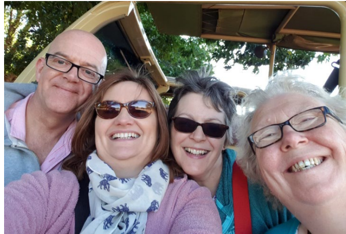
Many second year curates have the opportunity to grow through visits to our link dioceses in Canada, Africa, or Germany— this group enjoying a day on safari.

Alongside the IME2 training you may wish to continue studying on an accredited pathway with Common Awards. Curates who already have a Diploma award from IME1 may register for a BA in Theology, Ministry and Mission. Others who already have a degree or higher award or are recognised as potential theological educators have opportunities to further their studies alongside their curate programme.