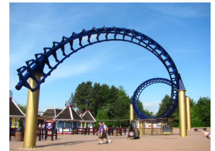
Alton Towers near Uttoxeter