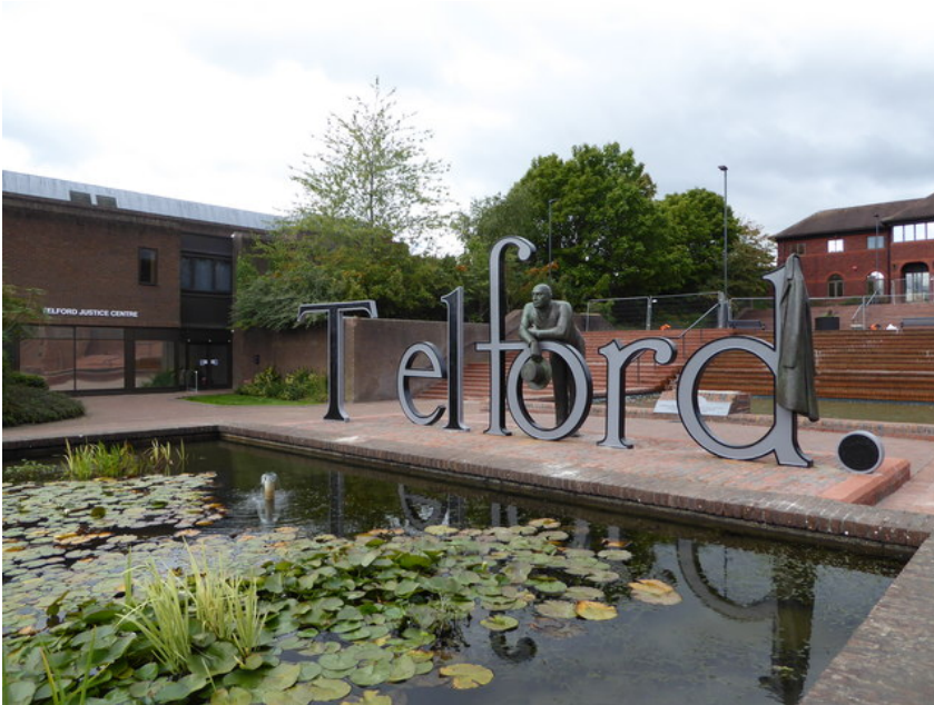
Public art in Telford Civic Centre